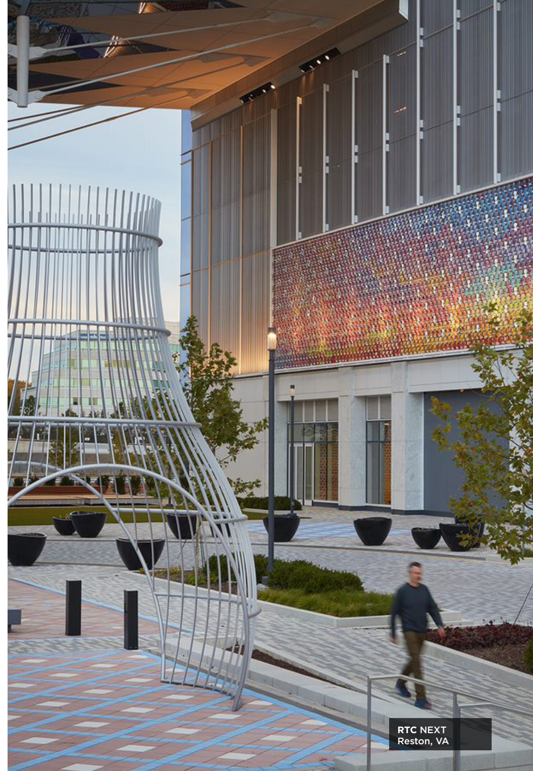
RTC NEXT Reston, VA

We continue to address the needs of our stakeholders by making efforts to maintain and improve our ESG performance across three pillars: climate action, resilience, and social good. Through these efforts, we demonstrate that operating and developing commercial real estate can be conducted with a conscious regard for the environment and wider society while mutually benefiting our stakeholders.