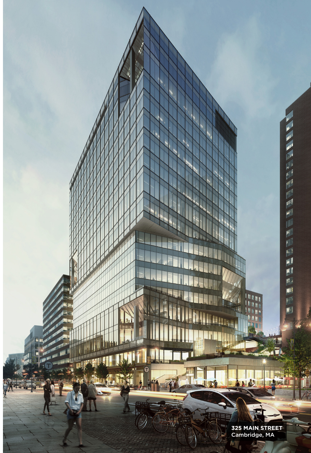
325 MAIN STREET Cambridge, MA

1 The expected net proceeds used to finance/refinance this Future Eligible Green Project will be finalized at the time of LEED certification. See future Green Bond Allocation Reports for updated or finalized allocation amounts.