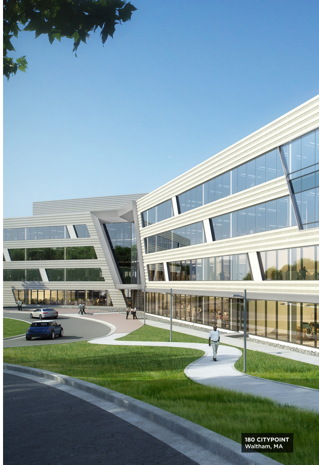
180 CITYPOINT Waltham, MA

1 The expected net proceeds used to finance/refinance this Future Eligible Green Project will be finalized at the time of LEED certification. See future Green Bond Allocation Reports for updated or finalized allocation amounts.